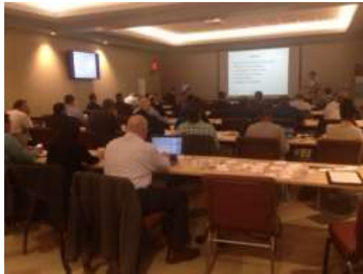
Class at Dominion Education Center

A CHP workshop was held on April 25 th at Dominion East Ohio's new Hudson Ohio training center. Thirty-two individuals attended the session. All presentations were well received. Links to the presentations appear at the following. The tour of Kent State's CHP installation was excellent.