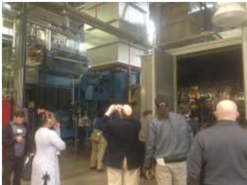
7MW Gas Turbine System