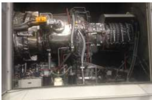
7MW Gas Turbine